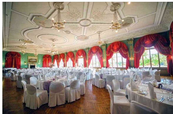
Einsiedeln Abbey, Hotel Seeburg