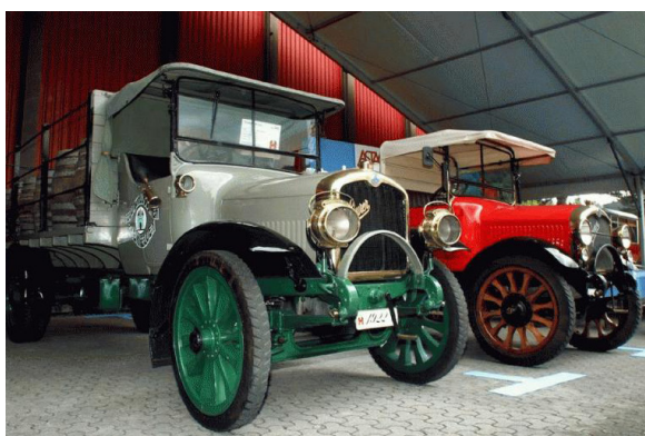
Appenzell, Lucerne: Verkehrshaus der Schweiz