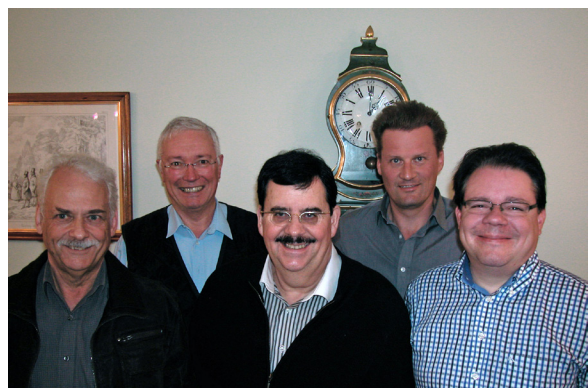
Organizing committee from the Cadillac Club of Switzerland